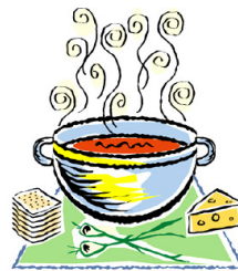
SHYG Chili Fundraiser

This is an event that you will definitely not want to miss and will feature the world famous "secret chili recipe" for which this event is known. There is no doubt that this recipe cannot be duplicated!!! Come to the Ligo Room and pick up some to go for an easy meal at home. Donations for the chili provide support for the yearly SHYG summer mission trip. Thanks for your support.